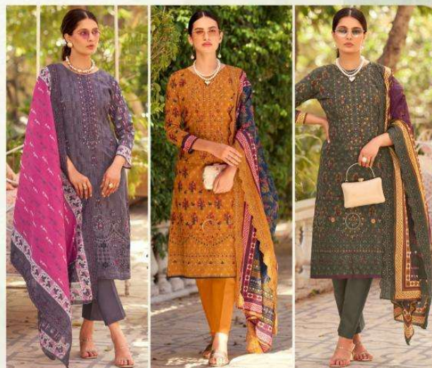
D.No. 2004 ***