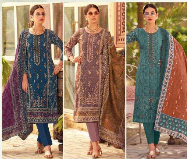
D.No. 2001 ***