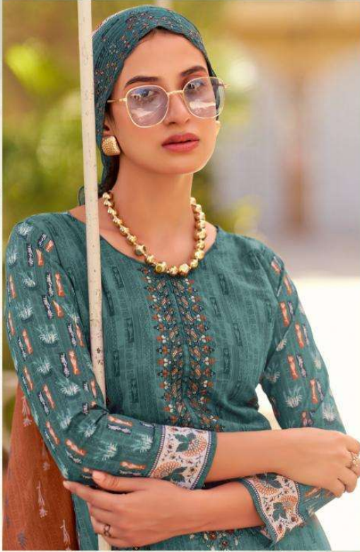
Enchanting charm, beauty beyond the stars!