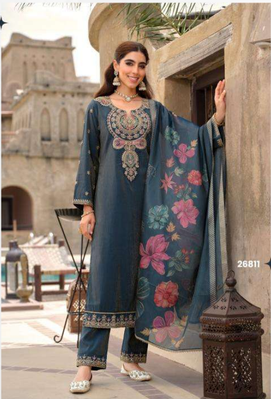
RADIANT IN CLASSIC CHARM WITH A MODERN FLORAL TWIST modern