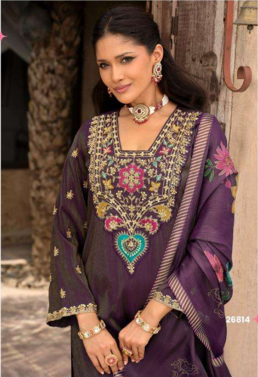
DRAPED IN ELEGANCE, REFLECTING CULTURAL RICHNESS