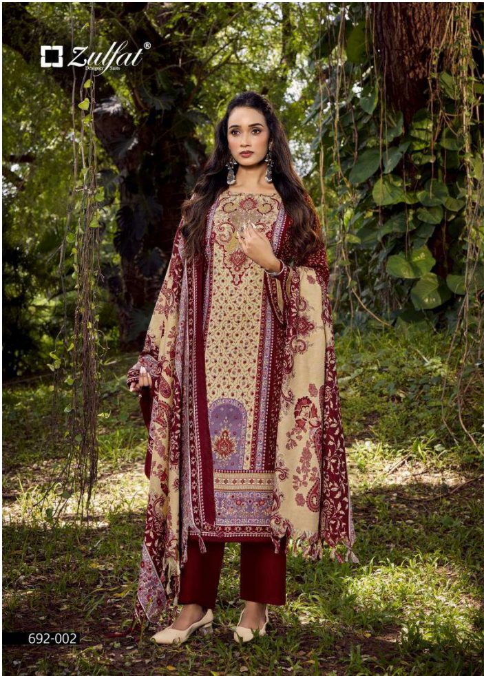
Exotic fabric that looks radiant in both an elegant drape or a flirtatious careless wrap.