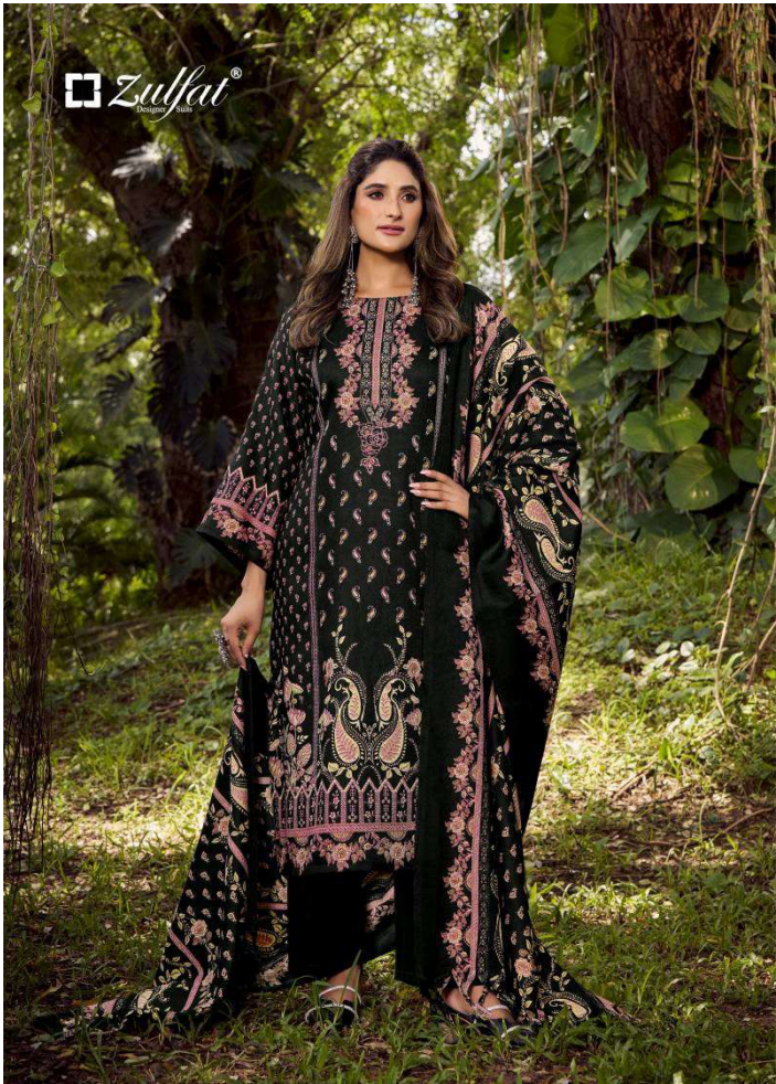
unique shade of the warmth of subtle print is together an avalanche of beauty. 692-001