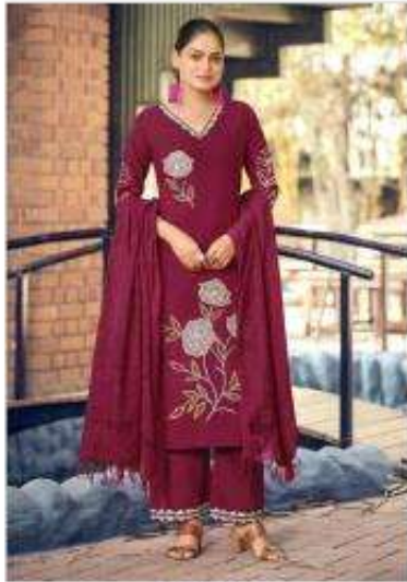
◆ 1003 ◆