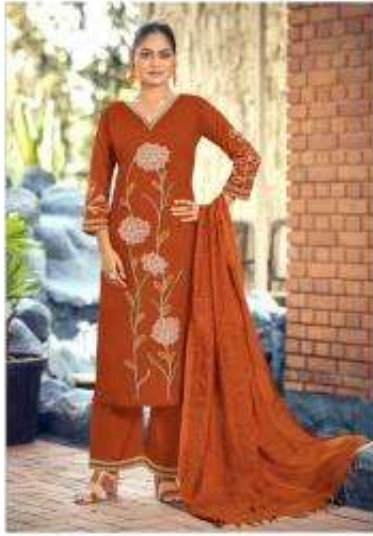
◆ 1001 ◆