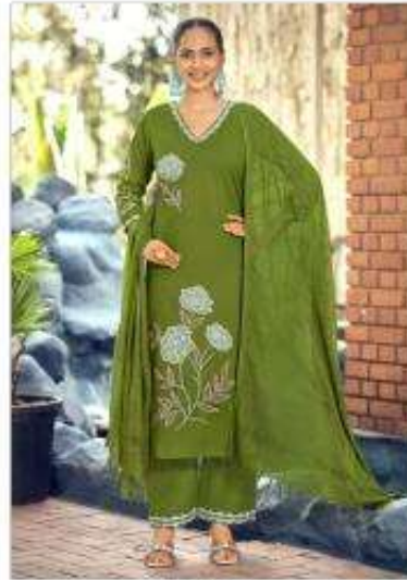
◆ 1004 ◆