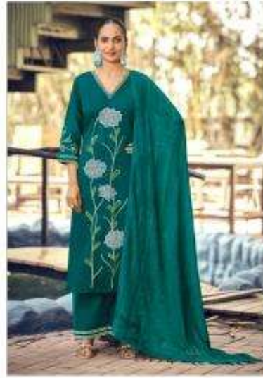
◆ 1002 ◆