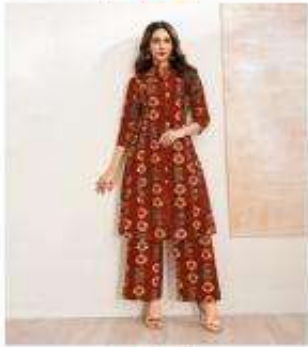
D.No. / 212