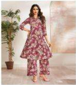
D.No. / 215