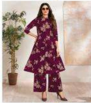
D.No. / 214