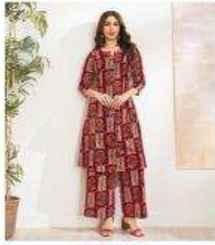
D.No. / 207