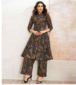
D.No. / 210