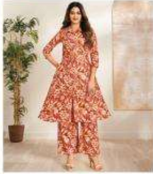
D.No. / 211