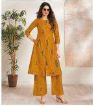
D.No. / 209