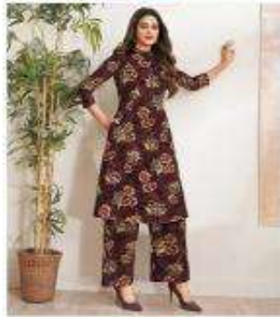
D.No. / 216