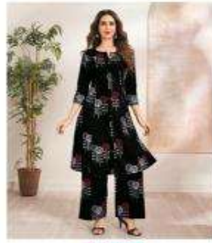
D.No. / 208