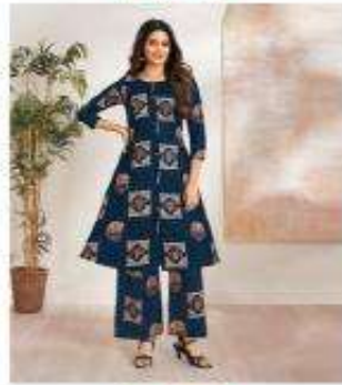
D.No. / 213