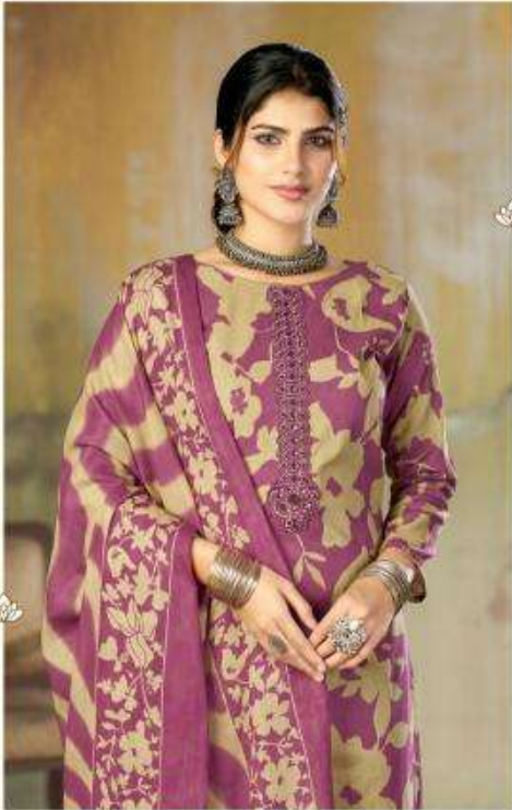
Model of Sari Kurta and 12 Low Neckline 2 Sleeve Kurta from collection 1190-C for Wedding Wear. D.No.1190-C