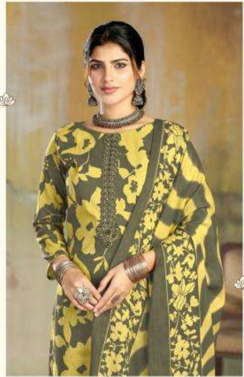
Small text above the product number, likely a brand or collection name. D.No.1190-0