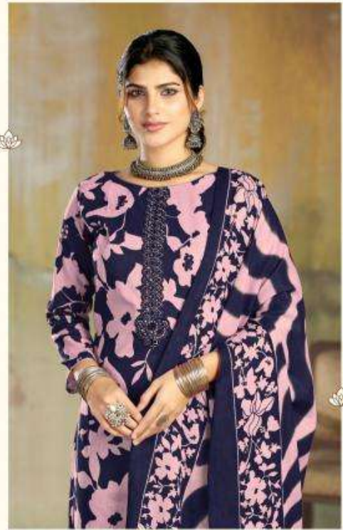
Small text describing the outfit details, including the brand name and the item number D.No.1190-B.