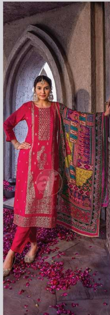
DASTOOR 3625 Volume 5