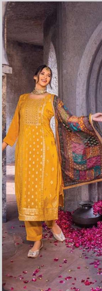
DASTOOR 3624 Volume 5