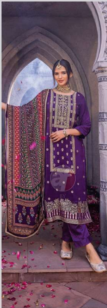
DASTOOR 3621 Volume 5