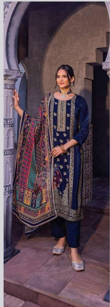
DASTOOR 3623 Volume 5