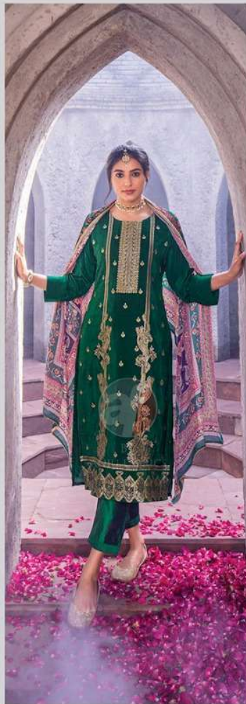
DASTOOR 3622 Volume 5