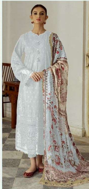
7773 D.No:-445 B