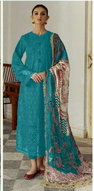
7773 D.No:-445 D