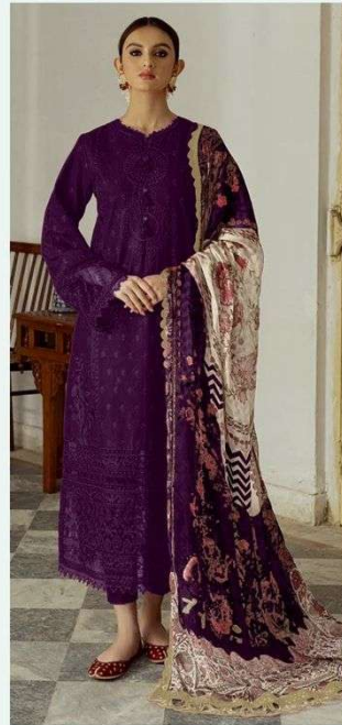
7773 D.No:-445 C