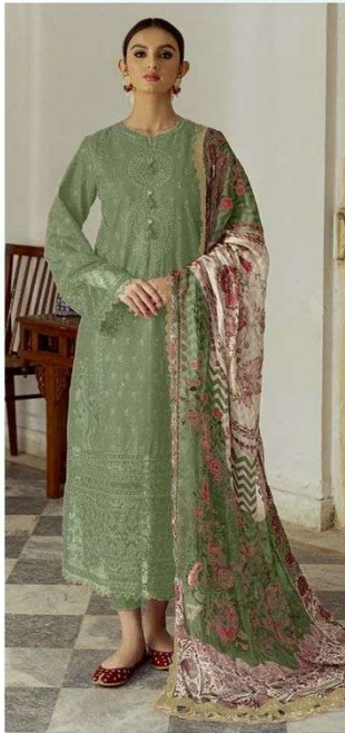
7773 D.No:-445 A

DUPATTA- HEAVY QUALITY MUSLINE COTTON DIGITAL PRINT FANCY DUPATTA